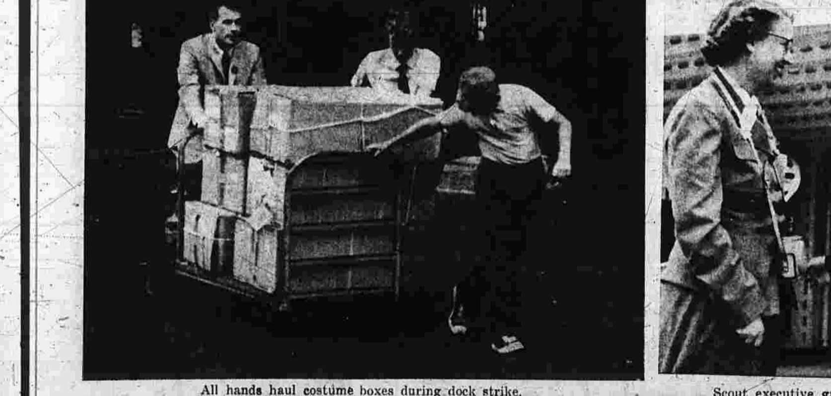
All hands haul costume boxes during dock strike.