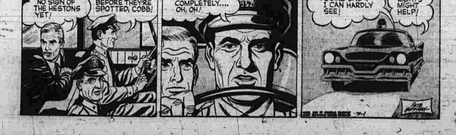
NO SIGN OF THE WESTONS

Phinney-Hunt Caravan Heads for Louisiana Thirty girls in the Phinney-Hunt Caravan, touring the country for a month, today are headed for New Orleans.