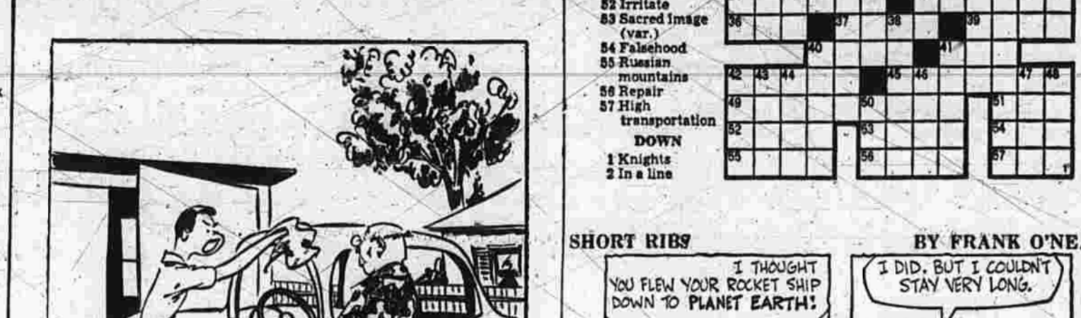
OLD MAN HORSTMAYER