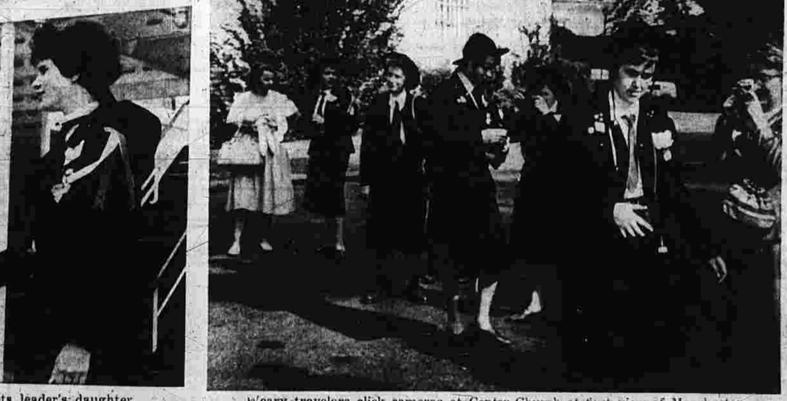
Scout executive greets leader's daughter.