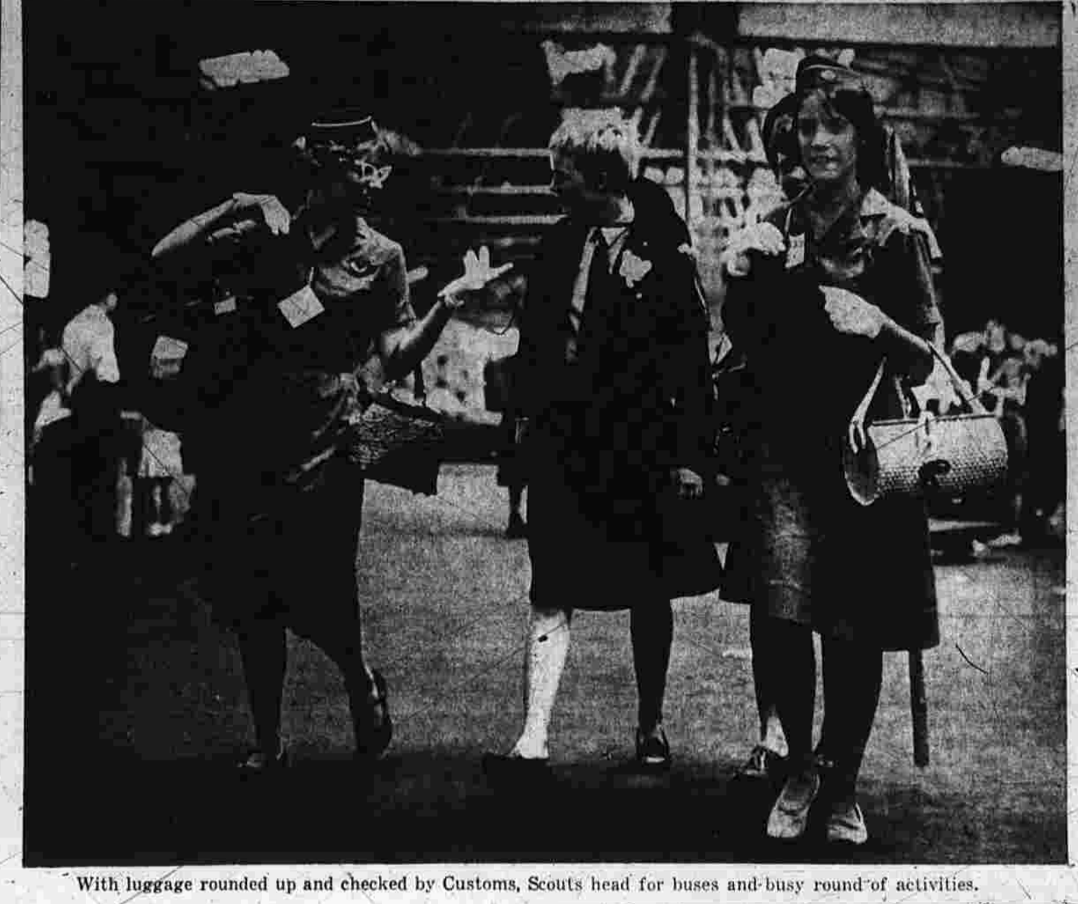
With luggage rounded up and checked by Customs, Scouts head for buses and busy round of activities.