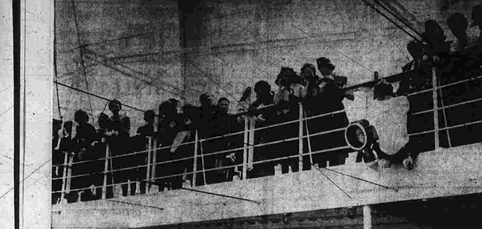
"The water is so far down and the buildings so high up."

Special GERANIUMS 3 FOR $1.00 3 INCH POTS. Members of Connecticut Bank and Trust Co. Charge Plan.