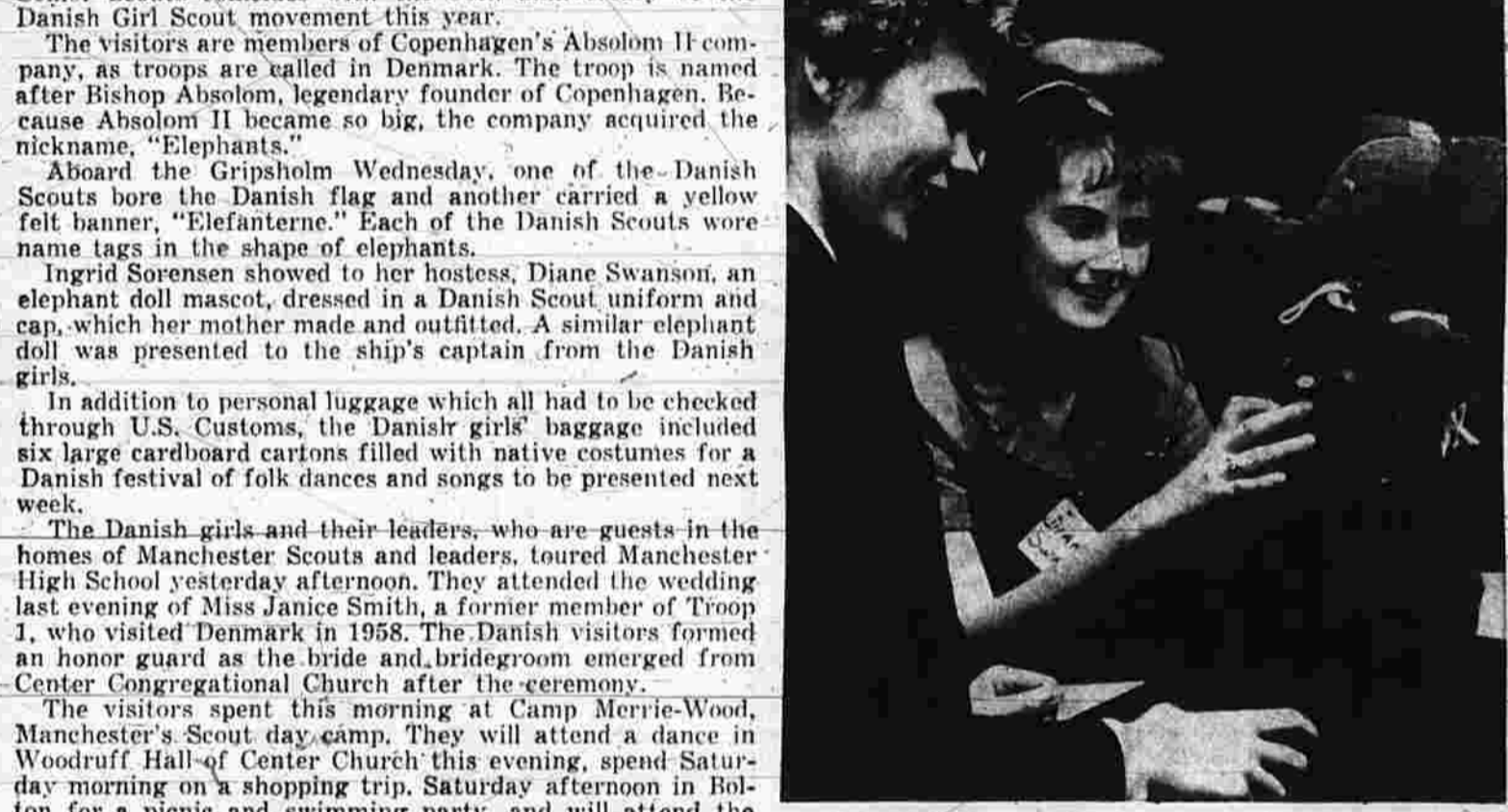
Elephant-mascot wears Danish uniform.