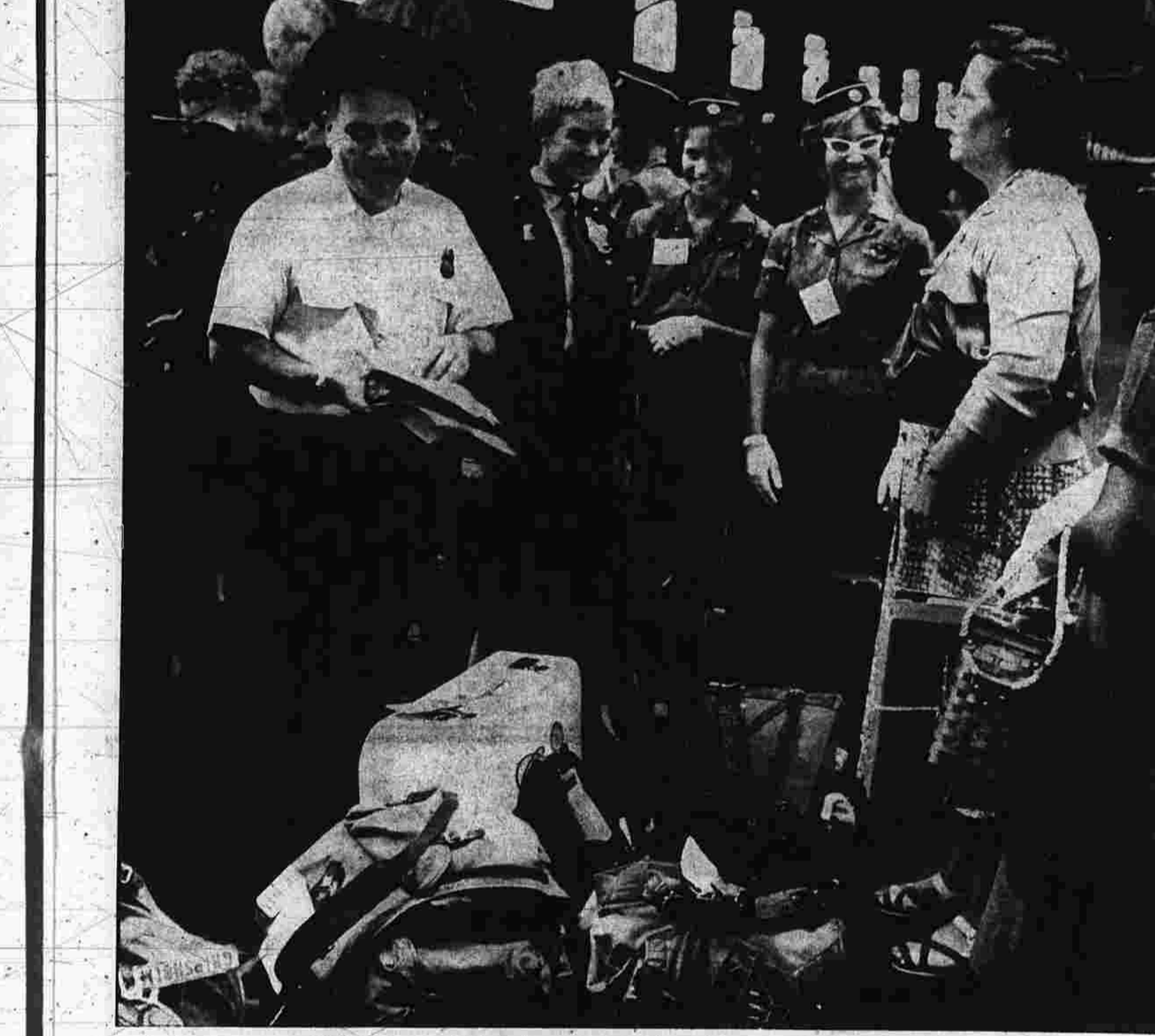
U.S. Customs agent performs duty with good humor and friendly welcome.